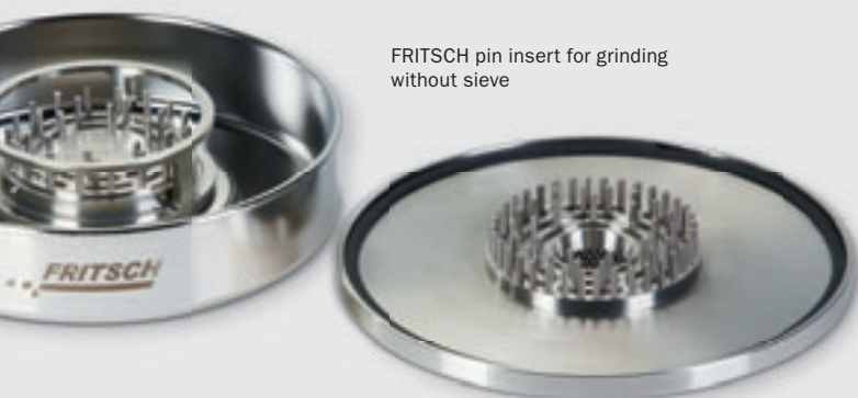
FRITSCH pin insert for grinding without sieve

Another suggestion: During grinding of temperature-sensitive samples, the conversion kit for grinding large quantities with its large nylon support sack ensures a high air throughput, resulting in even better cooling.