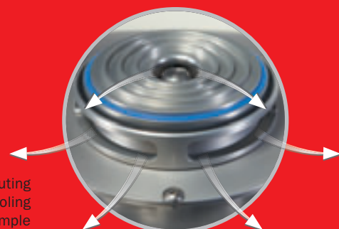
Ingenious air routing for efficient cooling of the sample

Available only from FRITSCH: The ingenious air routing of the PULVERISETTE 14 classic line ensures a constant airflow to cool the rotor, all motor components and the grinding material in the collecting vessel. At the same time, a large fan blows the cooling air into the instrument through a foam particle filter to create positive pressure that prevents the penetration of dirt particles from the ambient air.