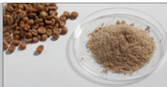
Raw coffee before and after grinding with the P-14 and sieve ring 1 mm trapezoidal perforation at 20,000 rpm

IQ/OQ documentation available to support equipment qualification.