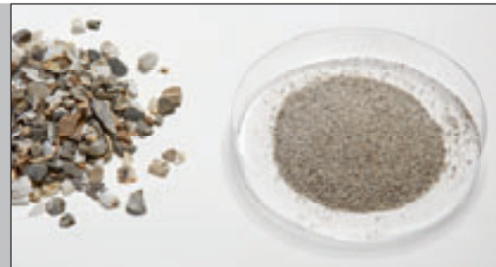
Stones before and after grinding with the Cross Beater Mill PULVERISETTE 16