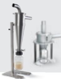
High-performance and small volume Cyclone separator

The result: a particularly fast and efficient grinding with minimised thermal load at a significantly higher throughput and particularly easy and fast cleaning.