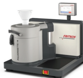
Fig. 3: Variable Speed Rotor Mill PULVERISETTE 14 premium line: impact, shearing and cutting comminution in one instrument