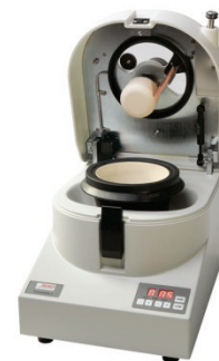
Fig. 1: Mortar Grinder PULVERISETTE 2: using pressure and friction and a mortar bowl and pestle

Soft or fibrous materials such as many foods, polymers, and textiles are efficiently processed using mills with some type of sharp blade to provide a cutting or slicing mechanism. Harder materials like various minerals, metals, ceramics, glass, and so forth are efficiently reduced in size by either direct impact forces (e.g., a ball or a hammering action) or through frictional or compression forces (e.g., a mortar and pestle).